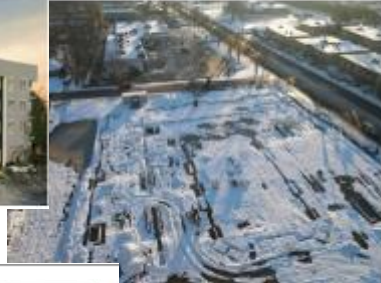
Approved Exterior Design